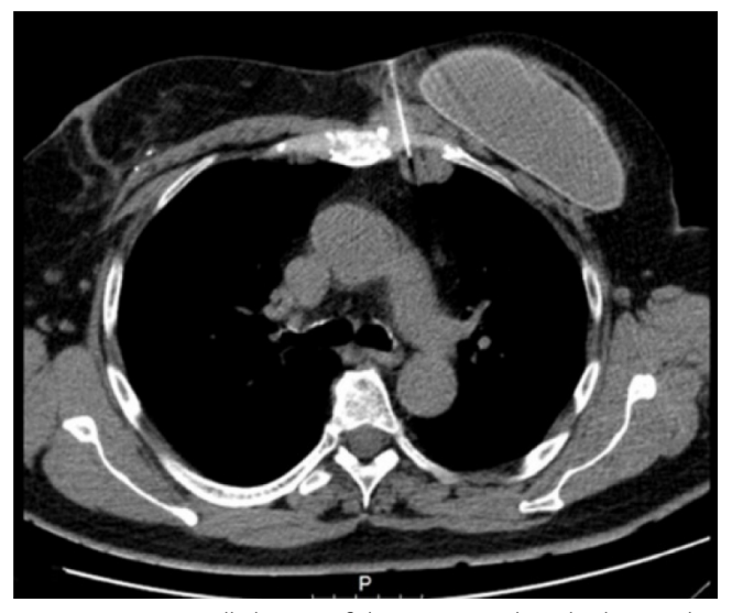
Figure 3. Core needle biopsy of the suspicious lymphadenopathy.

material in polarized light and multinucleated giant cells with vacuoles of different sizes and asteroid bodies; compatible with silicone granuloma".