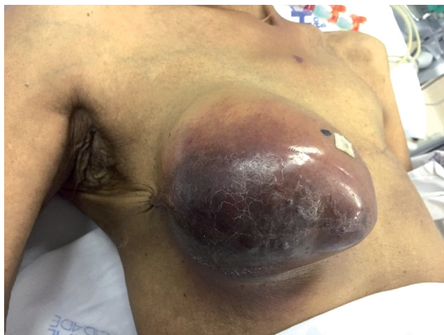
Figure 1. Right breast, preoperative aspect.

Regarding the examinations brought in by the patient, the US revealed the right breast node, which measured 5.7 cm, BI-RADS ® 5 report; the core-biopsy showed evidence of the proliferation of oval cells with an extensive area of necrosis; and the