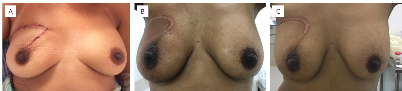
Figure 3. Sequency: first day after the procedure; one month after the procedure; six months after the procedure.

In this scenario, we can reduce mastectomy rates in locally advanced tumors, offering patients better results without jeopardizing oncological safety. In order to do so, training in oncoplastic surgery is necessary, so that better surgical techniques can be applied and aesthetic results can be maintained without reducing quality of life and local control, optimizing operative time, and reducing adverse effects and costs 15 .