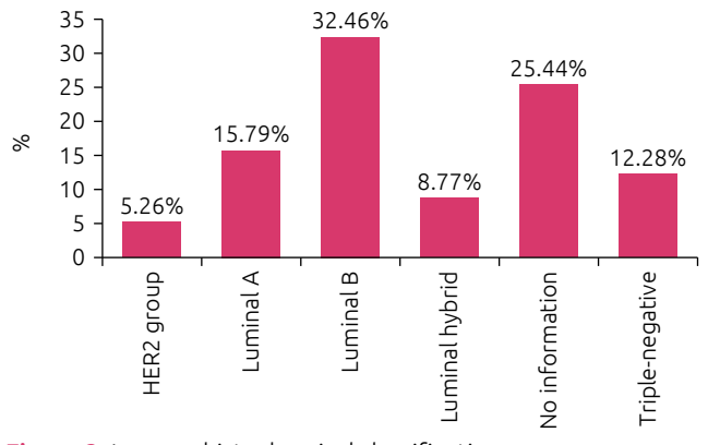
Figure 2. Immunohistochemical classification