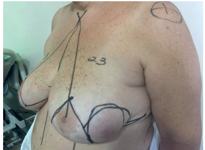
Figure 1. The tumor had 4 cm and was on the intersection outer quadrants of left breast with skin commitment.

Most tumors (60–75%) are benign, with borderline and malignant tumors constituting 15–20% and 10–20%, respectively.