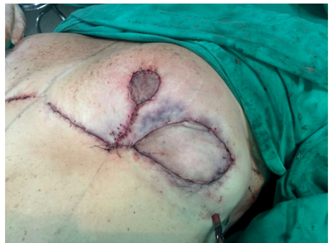
Figure 2. Immediate post-operative result using inferior dermcutaneous pedicle technique.