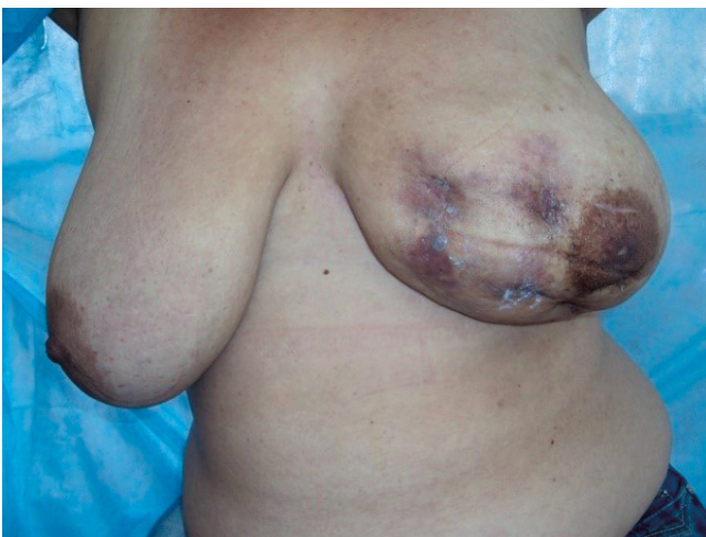
Figure 1. Patient, 30 years old, presenting lesion compatible with an abscess in the left breast, with four erythematous foci.

A 30-year-old patient presented a typical sign of abscess (Figure 1) and a nodule in the right UOQ one month before her appointment.