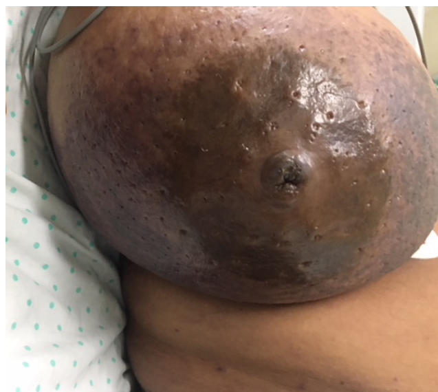
Figure 1. Frontal view of affected right breast.

Necrotizing fasciitis (NF) is a rare but aggressive soft tissue infection most commonly affecting the abdominal wall, perineum and extremities, being rare in the breast. It is characterized by widespread fascial necrosis with relative sparing of skin and muscle; it occurs more commonly in patients with comorbidities such as alcoholism, immunocompromise, intravenous drug use and diabetes mellitus. Streptococcus pyogenes is the most commonly implicated organism and it is cultured in approximately one