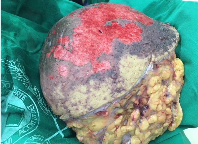
Figure 2. Wide surgical excision of necrotic tissue (right mastectomy).